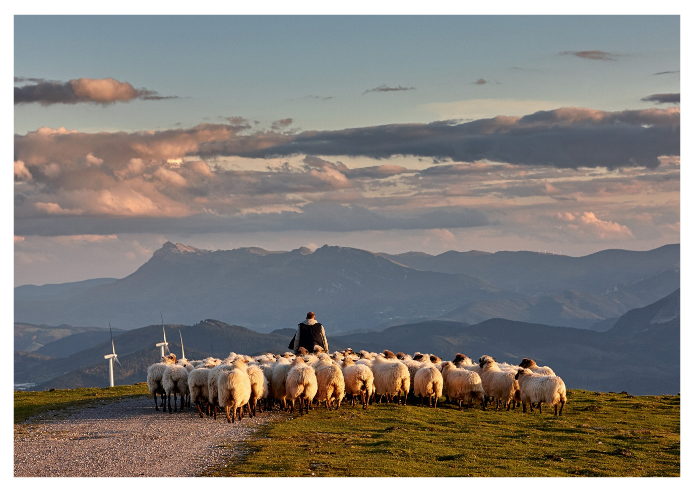
"My sheep hear my voice, says the Lord; I know them, and they follow me."