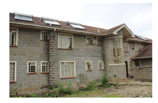
For more information on this and other projects, please go to https://www.missio.org/explore.aspx

There are about 30 resident religious brothers and fathers living in St. Francis Caracciolo Formation House. The motivation of this project is to offer great accessibility of a hot water supply at a low cost. The installation of solar heating system equipment will replace the old kit (electric and solar system: 600 liters for house use with 200 liters for the kitchen) whose energy consumption weighs heavily on the household's resources. The supply of hot water from a solar heater kit is a great use of green energy. This aspect will help save money which can then be allocated for other urgent expenses inside the formation house. Please consider supporting this project which will provide hot water without interruption in bathrooms and kitchens as well as prevent diseases that can be caused by low temperatures during the cold season in Nairobi.