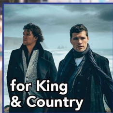
for King & Country