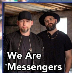
We Are Messengers