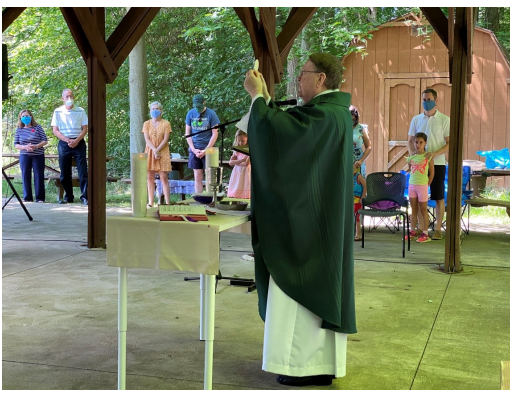
Please plan to bring your own lawn chair to sit on during Mass.