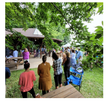
Please plan to bring your own lawn chair to sit on during Mass.

If weather is not conducive to sitting outdoors Mass will be moved inside