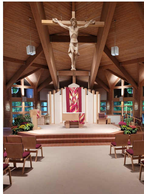
SPIRIT is on the Holy Martyrs website, Facebook and Instagram

We will have SPIRIT this Sunday, Oct 10, 2021 starting with Mass at 5:00. We will begin our Confirmation series called "Purpose" for both 7 th and 8 th grade. The first session is called "Beginnings". We will also collect food items for St Bernard's in Akron.