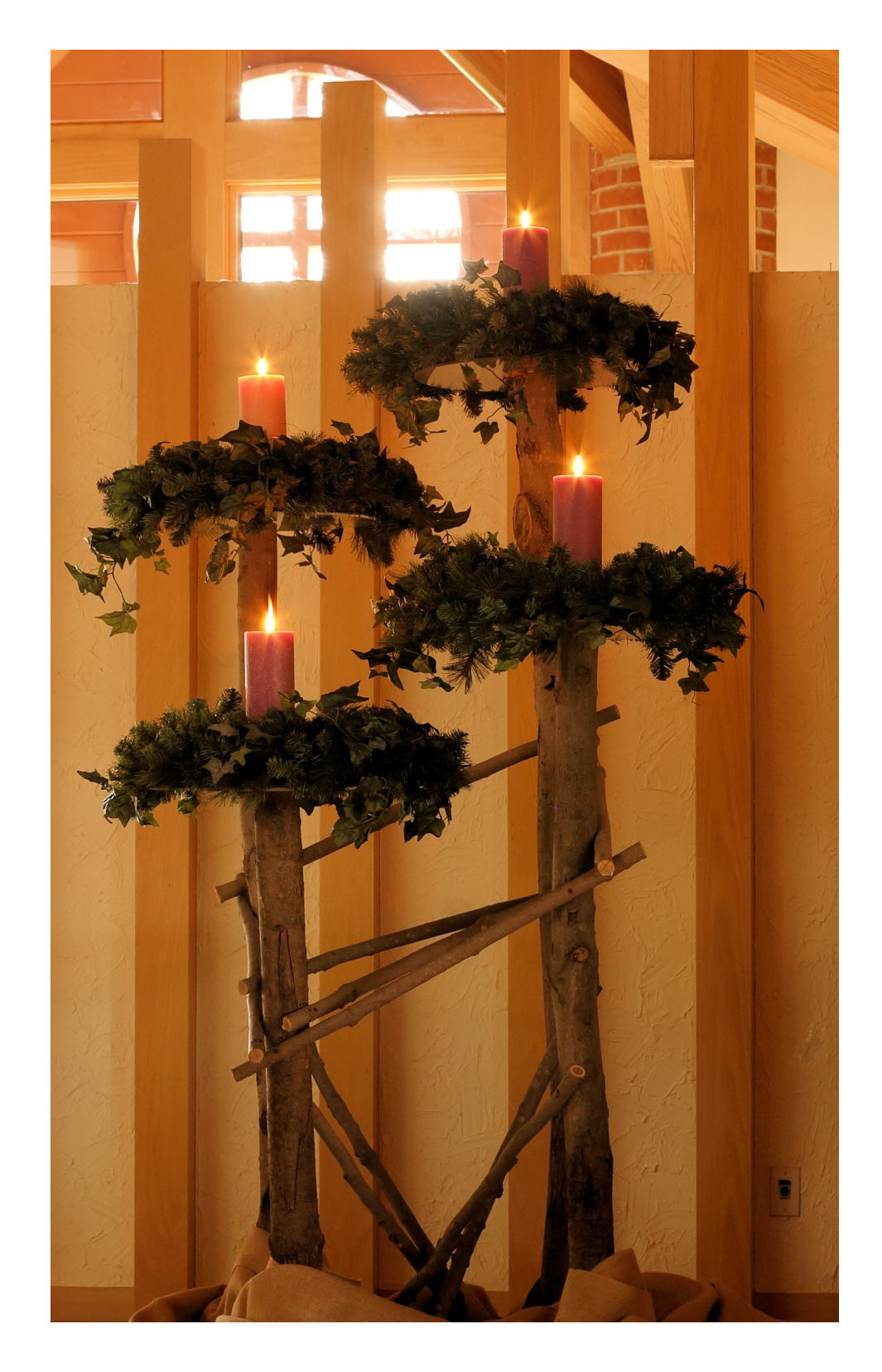
December 19, 2021 The Fourth Sunday of Advent

Holy Martyrs Catholic Church 3100 OLD WEYMOUTH RD MEDINA, OH 44256