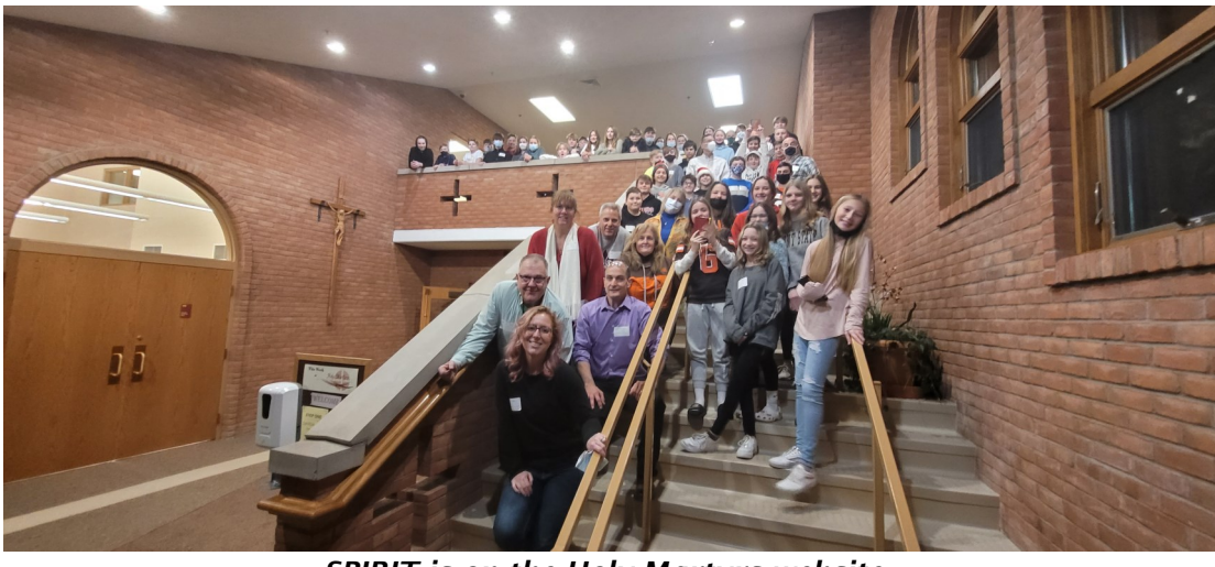
SPIRIT is on the Holy Martyrs website, Facebook and Instagram

We will be off December 26 and January 2. We are going to be doing some type of event during the Christmas break.