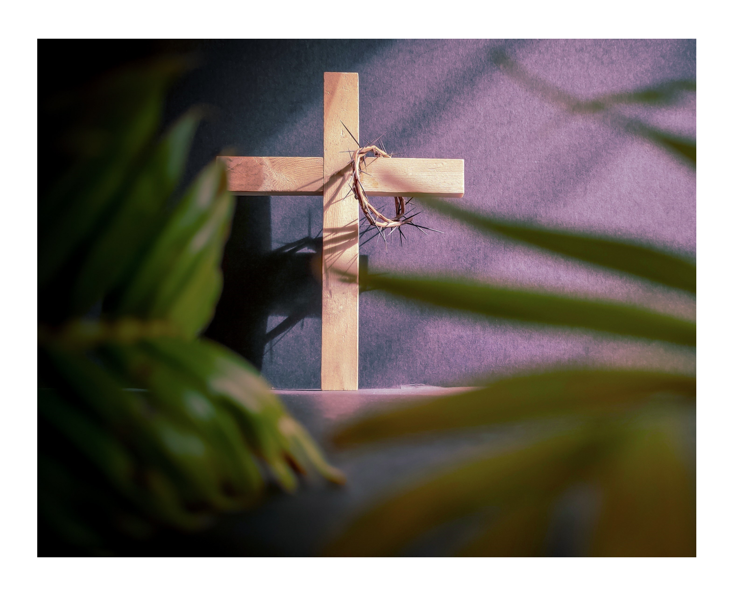
March 6, 2022 The First Sunday of Lent

Holy Martyrs Catholic Church 3100 OLD WEYMOUTH RD MEDINA, OH 44256