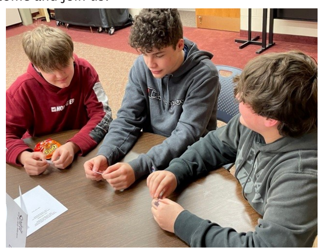
SPIRIT is on the Holy Martyrs website, Facebook and Instaaram

"Purpose" our Confirmation series. We will continue with our Confirmation "Purpose" Series this Sunday, March 6, 2022. The lounge is open for all SPIRIT and Life Teen parents during the SPIRIT and Life Teen sessions on Sunday evening. Please feel free to come and join us.