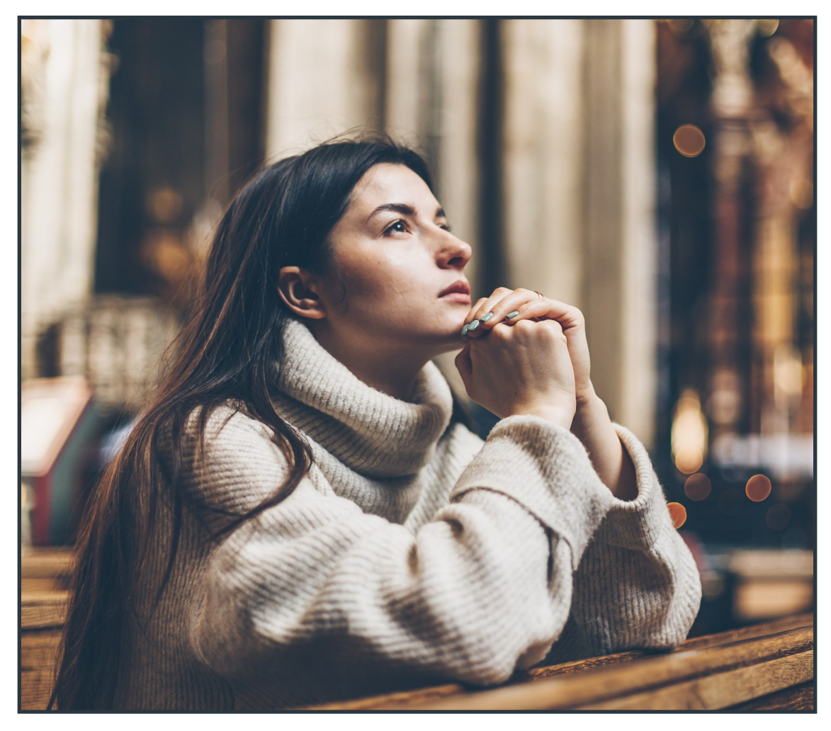
"There is need of only one thing"

Sixteenth Sunday in Ordinary Time July 17, 2022