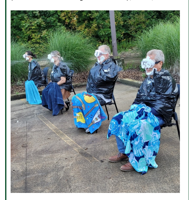
SPIRIT is on the Holy Martyrs Website, Facebook and Instagram

starting with Mass at 5:00 PM. We talked about the sacrament of Baptism. We will not have Spirit on Sunday, Oct 2, 2022 due to Confirmation taking place. We will meet again on Sunday, Oct 9, 2022.