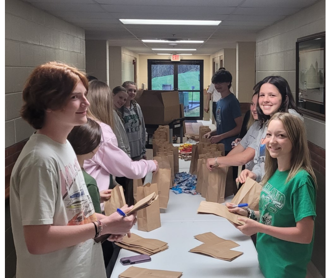
SPIRIT is on the Holy Martyrs Website, Facebook and Instagram

SPIRIT, our 7th and 8th grade youth group program, met on Sunday, April 16, 2023 starting with Mass at 5:00 PM. We put together brown bag lunches for St. Bernard's in Akron and we also talked about how we can be "Transformed" through Jesus' death and resurrection. We will meet on Sunday, April 23, 2023 starting with 5:00 PM Mass and talk about being witnesses to Christ.