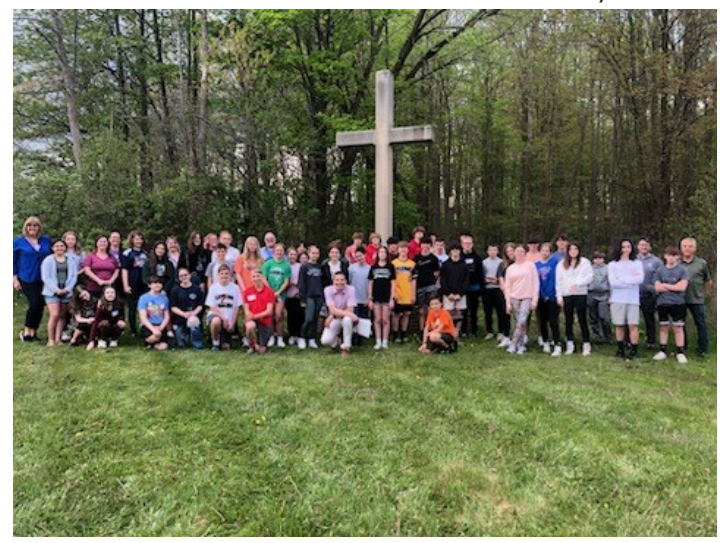
SPIRIT is on the Holy Martyrs Website, Facebook & Instagram

walked out to the cross at Old Weymouth Rd and Route 3 to reflect on our growing closer to Christ. Our core team adult members then made banana splits while blindfolded and were given direction by the students on what to do to make the banana split. Thank you to all Spirit families and Core Team members for all of the hard work this year.