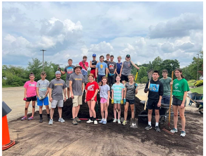
SPIRIT is on the Holy Martyrs Website, Facebook & Instagram