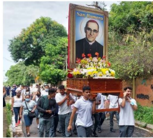
COAR students carry an image of St. Romero on his feast day