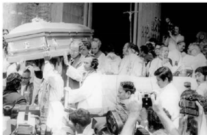
CLAM team members carry St. Romero's casket at his funeral