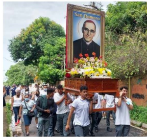
COAR students carry an image of St. Romero on his feast day