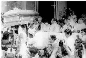
CLAM team members carry St. Romero's casket at his funeral