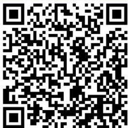
HM Kids Monday

Please use the QR code below for the evening you would like, or go to the Holy Martyrs website and look under "events" for HM Kids