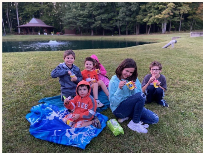
HM Kids Tuesday