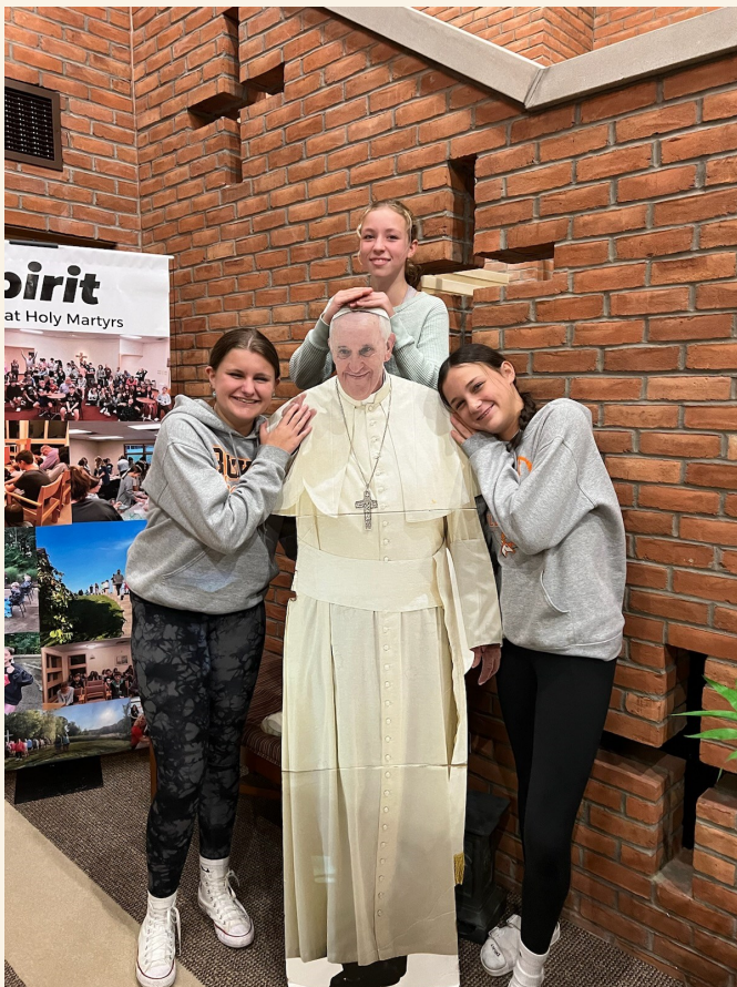
Spirit is our 7th and 8th grade youth group program, at Holy Martyrs.