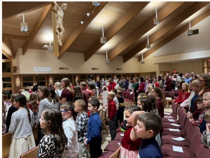
HM Kids Tuesday