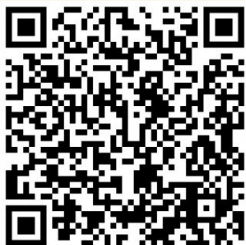
HM Kids Monday

Please use the QR code below for the evening you would like, or go to the Holy Martyrs website and look under "events" for HM Kids