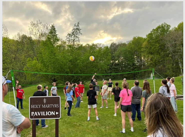
Life Teen will meet tonight, September 22nd following the 5:00 PM Contemporary Mass.