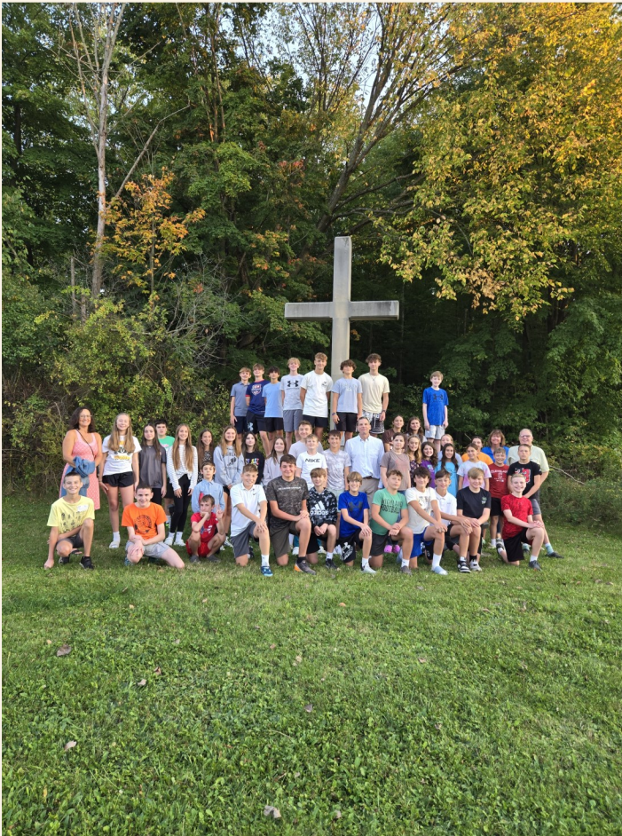
Spirit is our 7th and 8th grade youth group program, at Holy Martyrs.

On Sunday, Sept 22, 2024, we will begin with 5:00 PM Mass and our topic of the evening will be "Step 1: God is Love".