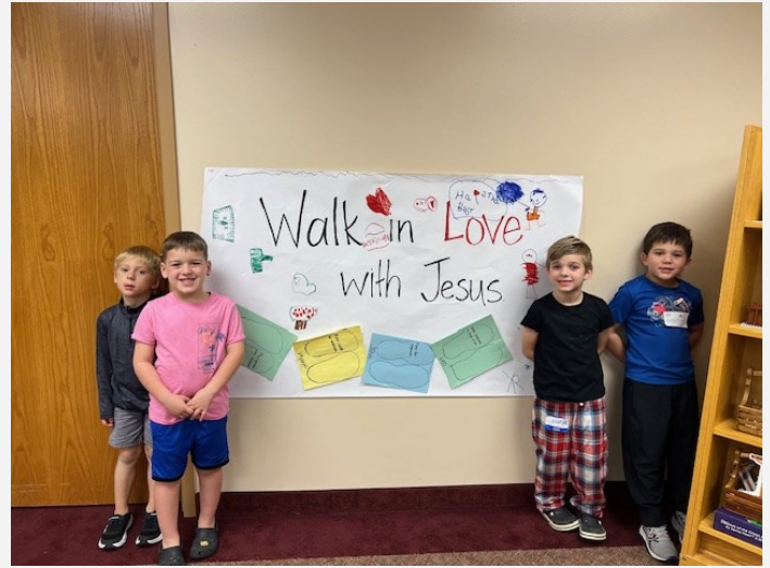
Our Kindergartners learn to Walk with Love Like Jesus in HM Kids