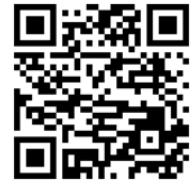
Vanco e-Giving HM Cares

There continues to be great need within our parish community in Medina County and across Northeast Ohio. Providing support to the poor is a foundational tenet of our Catholic faith and is central to the mission of Holy Martyrs Church. In this spirit, we ask that you consider supporting the HM Cares Ministry this holiday season by sharing your time, talent and/or treasure for those in need.