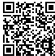
Turkey Run Sign Up