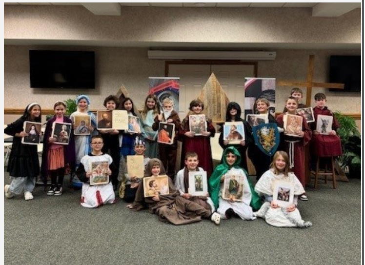
Each year our fourth graders study a saint and put on a Saint Wax Museum for the rest of our HM Kids. The Catechists work hard to help our HM Kids Saints understand what it means to Be Disciples. Great job fourth graders!