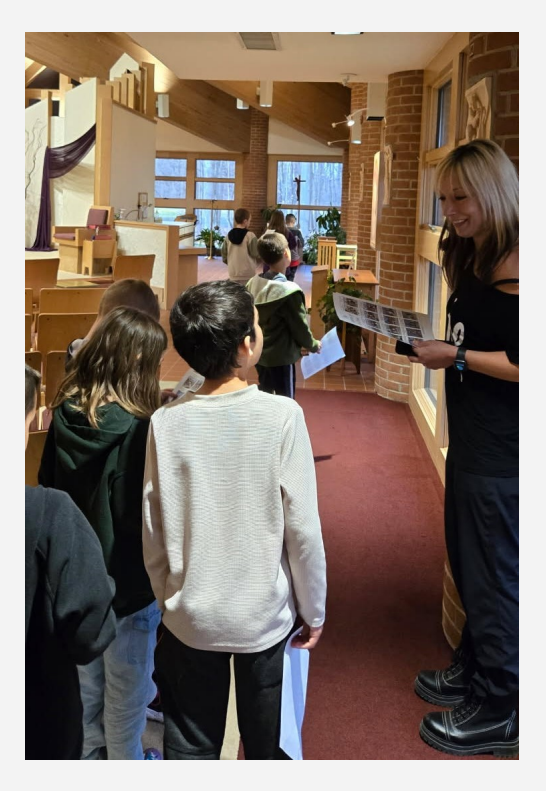
6th grade rehearses for The Stations of the Cross