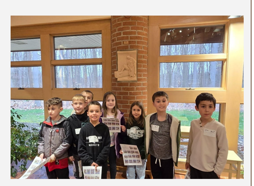
Second grade reviewing the Stations of the Cross