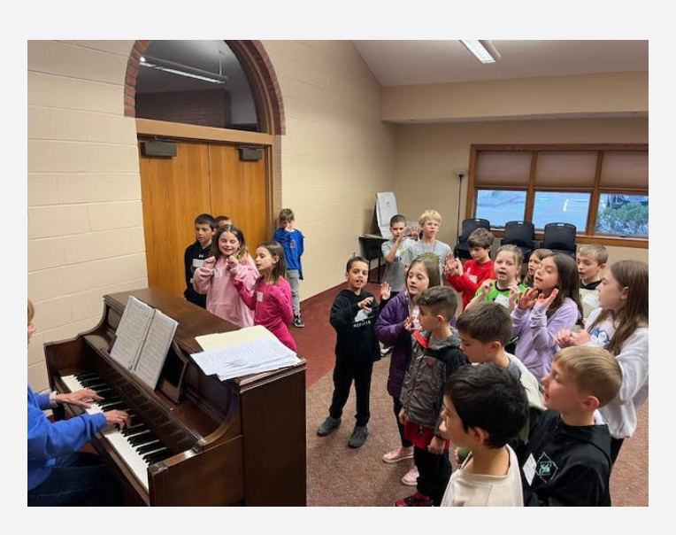
4th grade song practice for Pentecost